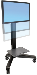
Display sold separately