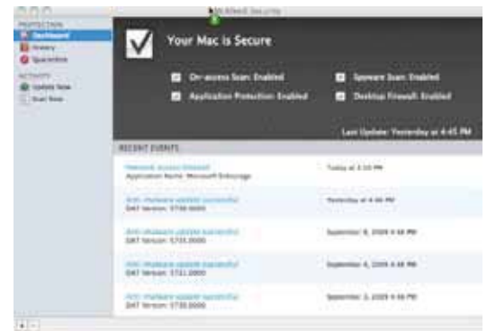
McAfee Endpoint Protection for Mac safeguards your Macs—and closes gaps in your security perimeter

This isn’t your father’s anti-virus. With its advanced anti-malware protection that includes anti-spyware, a robust system firewall, and application protection (as well as anti-virus), McAfee Endpoint Protection for Mac offers complete coverage for the Mac users in your organization.