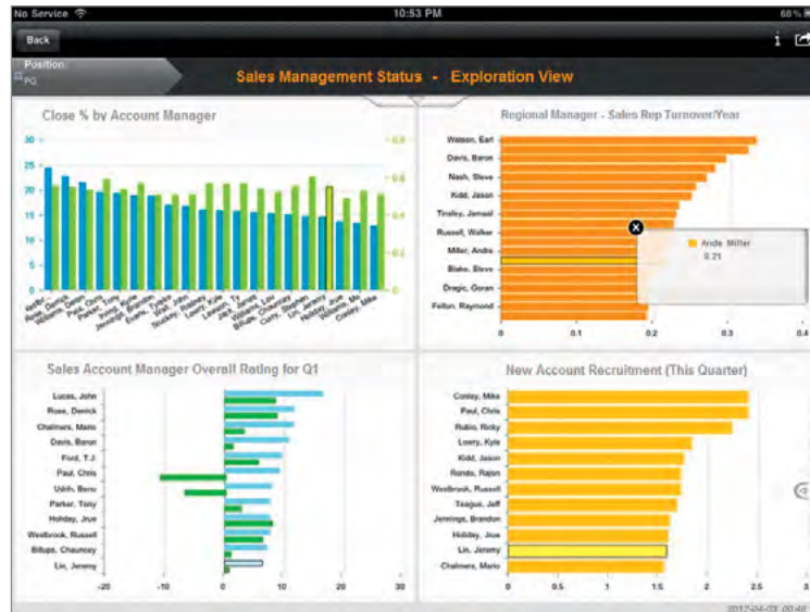
Different aspects of sales team performance for comparison in one intuitive screen