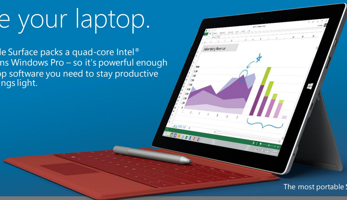
The most portable Surface

The most portable Surface packs a quad-core Intel® processor and runs Windows Pro – so it's powerful enough to run the desktop software you need to stay productive while keeping things light.