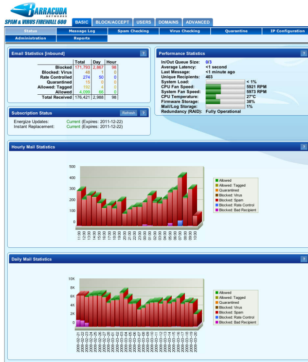
The Barracuda Spam & Virus Firewall filters all email messages and displays the number of emails received with statistics on how they were processed.

The Barracuda Spam & Virus Firewall is easy to set up with no software to install or network modifications required – minimizing ongoing administration. Energize Updates are delivered automatically by Barracuda Central, an advanced technology center where engineers work relentlessly to provide the latest spam definitions, virus definitions, and security updates which are distributed hourly for continuous protection against the latest threats.