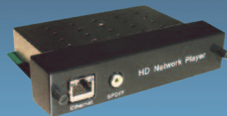
ICS-FW40D HD Streaming Receiver Adapter