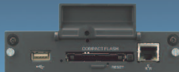
BKM-FW50 Networking Device