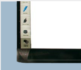
Interactive Projection on a Touch-sensitive Surface