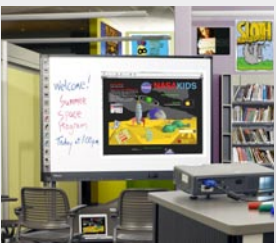
Optional Wireless Communication